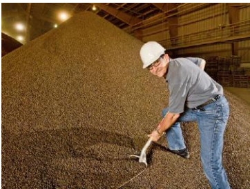
Waste Organic Materials